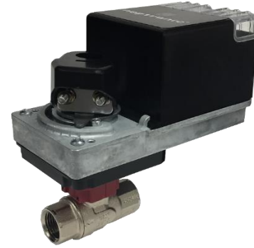
With B Series Actuators