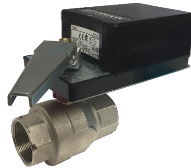
With L Series Actuators